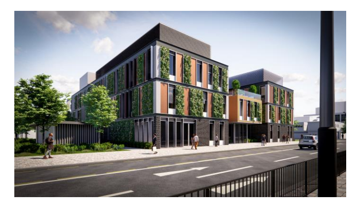
Architect drawing of the proposed development

The building will include GP surgeries, hospital outpatient and diagnostics facilities, a dental practice, social care support services and community facilities such as a café and community garden. There will be meeting and recreational rooms for Plymouth residents to use.